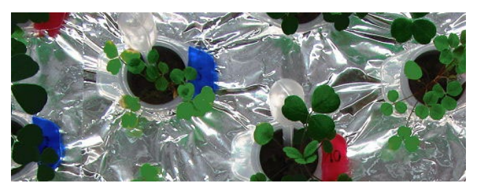
Medicago sativa (alfalfa) laboratory tests showed that the nanofertilizer performed equally well or better than a conventional pesticide on overall plant viability.