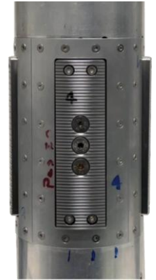
Underground penetration sequence of the self-burrowing probe (left, not to scale); and prototype of the radial anchor unit (right).